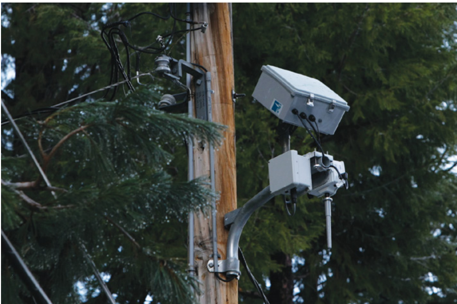
BGAN terminal in a NEMA enclosure, mounted on a remote power pole to backhaul smart meter data collected through an adjacent concentrator and access point.

With its own secure global network, including points of presence in New York, Amsterdam and Hong Kong, Inmarsat is well placed to support the emerging communications requirements of the utilities sector. In addition to its existing broadband service, BGAN, Inmarsat has launched BGAN M2M, which provides a two-way IP data-only service for low-volume, high-frequency transmissions of the type needed to support regular automated data reporting from Smart Grid and SCADA applications.