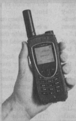
The Iridium 9575 Extreme.

Unlike SSB, a satellite phone can give you standard Internet access, allowing you to actually load a webpage if you need to. We do, however, recommend utilizing web compression service that